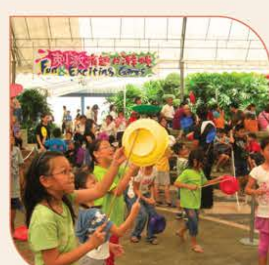
Plate Spinning Experiential Workshop